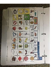
You can add this one to the LAMP WFL or Unity 84 low tech board.

https://aacianguagelab.com/resources/unity-manual-communication-boards You can add these a three ring binder, OR you can Velcro these to the top of a single page low-tech core word board.