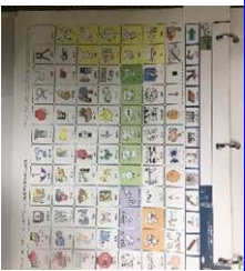
Attached to a one-page communication board.