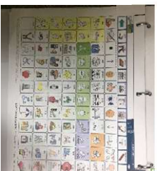
Attached to a one-page communication board.